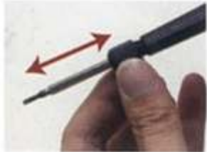
Adjustable Length (12-95mm)

A high quality chrome-vanadium molydenum steel screwdriver set with 4mm double ended hex blade, which fit into a connect type handle. The blades are satin chrome with oxide tips, 7 Pcs supplied in a plastic box.